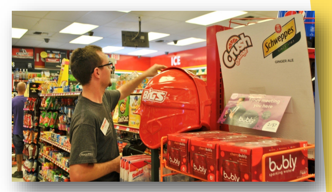
A sophomore student completing student internship at Fastrip in Taft.

TIL organized a few events this semester including a reunion of previous graduates and an open house for special educators and social workers.