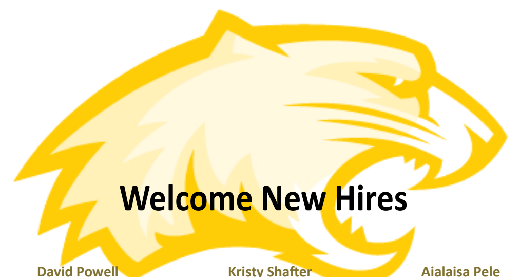
Accomodation Specialist to TIL Life Skills Aide