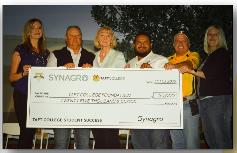
Synagro Donates $25,000 to the TC Foundation