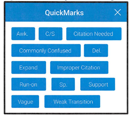
Figure 4: Custom or pre-defined drag-and-drop comments can be shared across institutions

Grade objectively and consistently with standards-aligned rubrics and show students how specific parts of their work affect their grade.