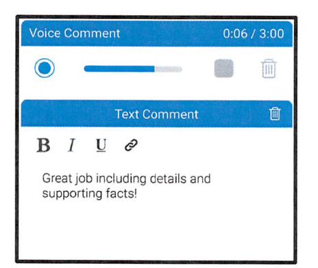
Figure 3: Feedback tools include voice and text comments

A range of feedback tools, including voice comments, drag-and-drop comments, rubric-associated comments, and rubricbased grading help to better engage students in the feedback process. Additionally, instructors can customize assignment types, rubrics, and feedback comments.